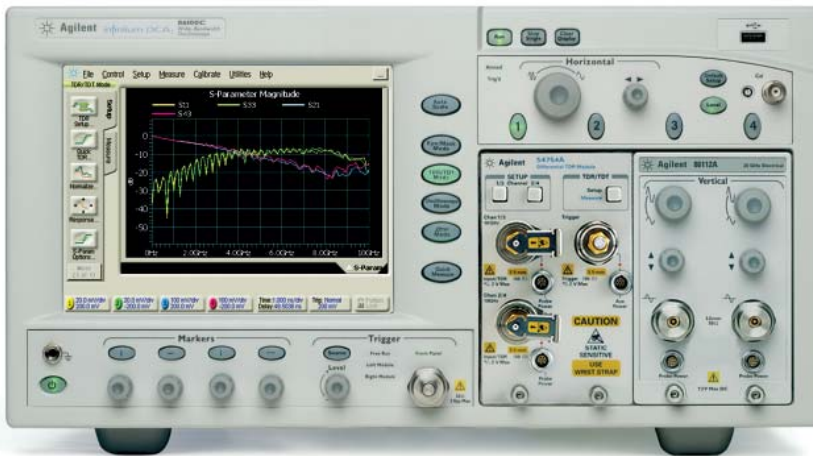
Complete solution to view simultaneous return loss and insertion loss.

Your choice to add these new capabilities to the 86100C/D mainframe and 54754A TDR module will protect your investment and allow you to upgrade existing assets. The combination of these solutions provides a very fast and cost-effective means to verify new designs and to speed your time to market.